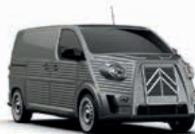
PLATINUM GREY - Metallic