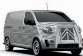
ARTENSE GREY - Metallic