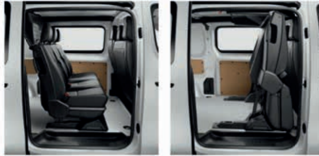
DOUBLE CABIN "MOBILE"