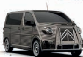
RICH OAK BROWN - Metallic