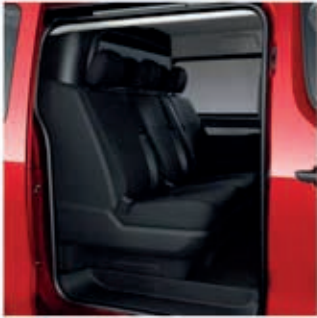
DOUBLE CABIN "FIXED"