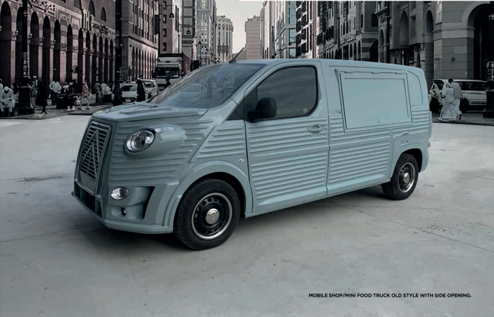
MOBILE SHOP/MINI FOOD TRUCK OLD STYLE WITH SIDE OPENING.