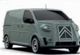
GIADA GREEN AC 539 - Pastel