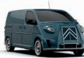
WEEK-END BLUE AC 625 - Pastel

* : Only with base vehicle of the same colour